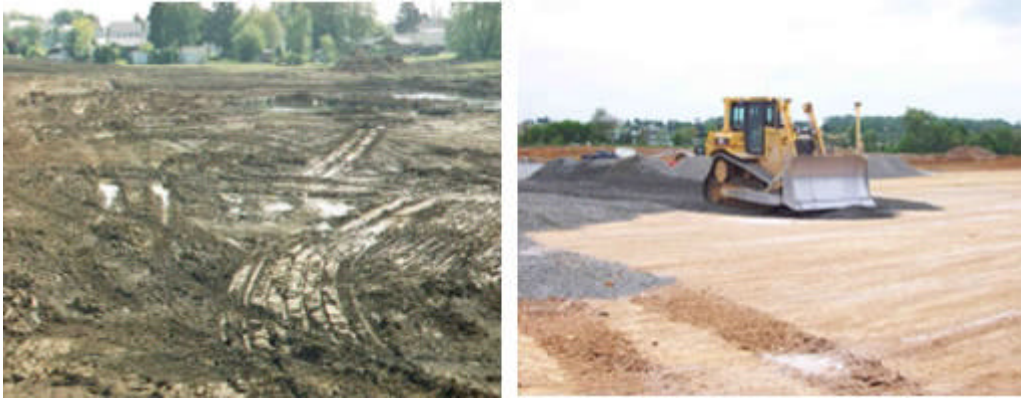
Before and after lime treatment to dry soils

waiting for the soil to dry through natural evaporation. “Dry-up” of wet soil at construction sites is one of the widest uses of lime for soil treatment. Generally, between 1 and 4 percent lime by mass of dry soil will improve a wet site sufficiently to allow construction activities to proceed.