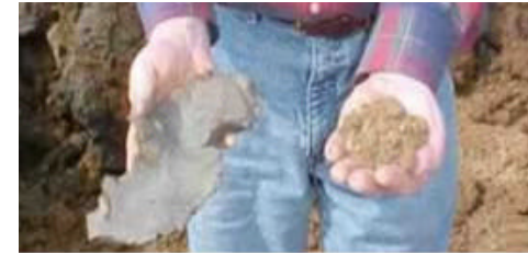
Clay soil, before and after lime modification

Small amounts of lime, such as 1 to 4 percent by mass of dry soil, can upgrade many unstable fine-grained soils. With heavy clay soils, additional lime may be necessary for these purposes. Modification improvements are generally temporary and will not produce permanent strength in clay soils.