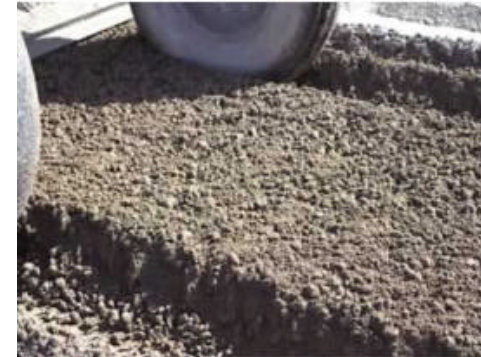
Lime flocculating clay