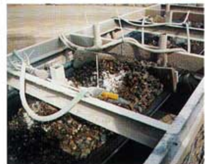
Mixing of lime, water and aggregate with belt plow (see detail below).