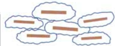
Figure 1. Reduction of water layer with lime.

Parallel arrangement of clay particles with hydrated water layers