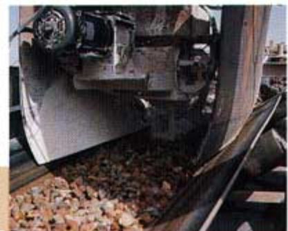
Lime being fed onto marginal aggregate.